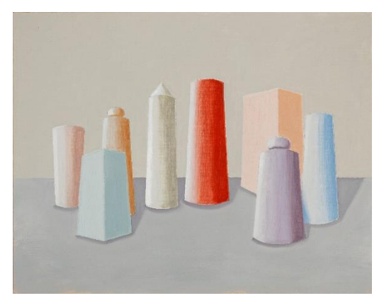
Eight Figures One Red, by Paul Gervais (2020) Oil on linen.

Kicking off its eighth decade in 2021, the Boca Raton Museum of Art encompasses a creative campus that includes the Museum in Mizner Park and the Art School. As one of South Florida's cultural landmarks, the Museum has provided cultural and artistic service to the community, and to many visitors from around the world, since it was founded by artists in 1950. Visit bocamuseum.org/visit/virtual-visits to enjoy the Museum's current online content, including video tours and digital gallery guides. Support for #BocaMuseumatHome and #KeepKidsSmartwithArt virtual programming is provided by Art Bridges Foundation and PNC. Museum hours, admission prices and more visitor information available at bocamuseum.org/visit. Media Contacts: Jose Lima and Bill Spring, editorial@newstravelsfast.com, 305-910-7762.