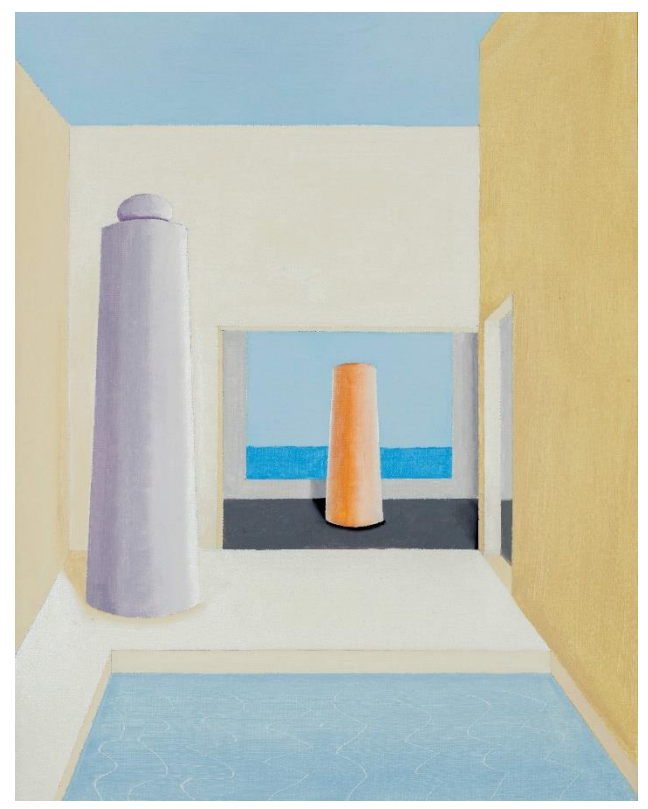
Sculpture and a Pool, by Paul Gervais (2020). Oil on linen over board.

In some of these interiors, Gervais includes depictions of paintings behind the forms as nods to iconic abstract expressionist works. In some of his other abstracts, Gervais projects tones inspired by 18<sup>th</sup>-century neo-classical colors. Others show forms with oxidized copper hues that give heed to the Statue of Liberty, with a horizon line of pale blue sky.